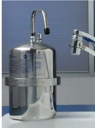
MP750SC Countertop Unit